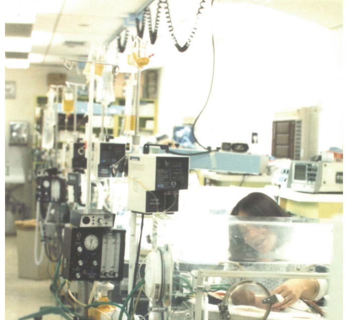
Figure 3. A typical intensive care nursery, with bright banks of fluorescent ceiling lights shining round the clock, and sunlight streaming in during the day through the windows onto the transparent isolettes below them.

The epidemiological evidence against the fluorescent lamps is equally undeniable. There was a precise parallel between their commercial introduction in the U.S. in 1938/39 and the sudden outbreak of the ROP epidemic there less than two years later. That same parallel happened again in the late 1940s and early 1950s across Europe and in many other industrialized countries. As fluorescent lamps became available in those countries after World War II, the preemies in their nurseries suddenly began to get the previously unknown ROP [28]. Retrospective studies among older blind people failed to find any earlier and initially overlooked cases in the U.S. or anywhere else [29].